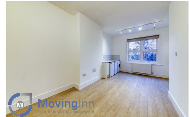
First Floor 229 sq.ft. (21.3 sq.m.) approx.